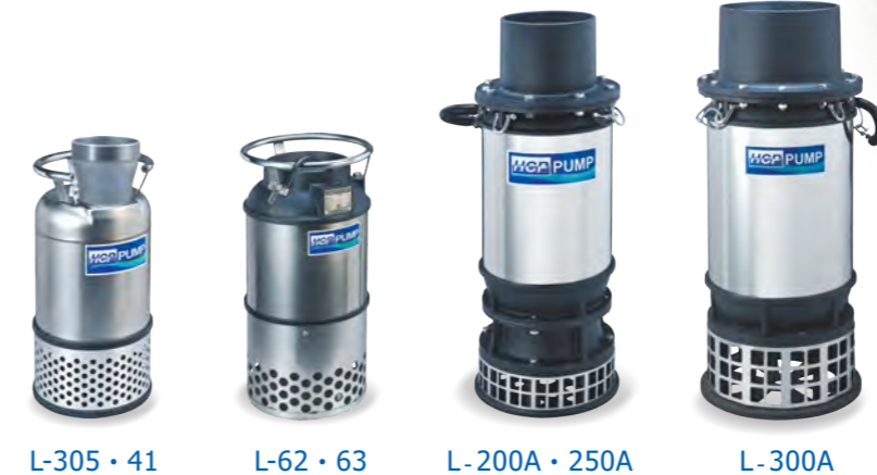
L-305 • 41 L-62 • 63 L-200A • 250A L-300A